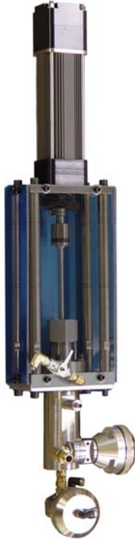
Servo-Flo 305 Shot Meter