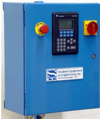
Keypad (with Screen) Operator Interface