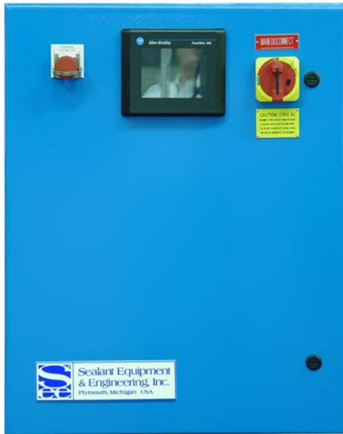
Color Touch Screen Operator Interface