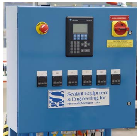
Keypad Operator Interface with 6-Zone Material Heat Control