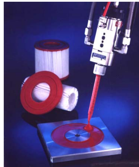
Automatic Valve for Molding Application with Shot Volume Accuracy