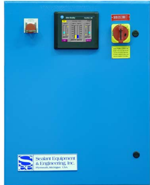
Color touch-screen allows operator to set the exact flow rate and volume of mixed material