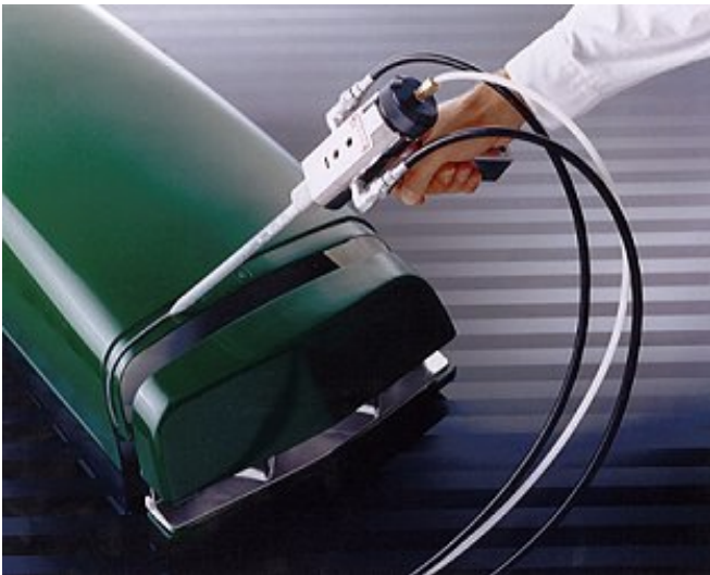
Manual Dispense Valve dispensing 2-Part Material for Composite Bonding Application